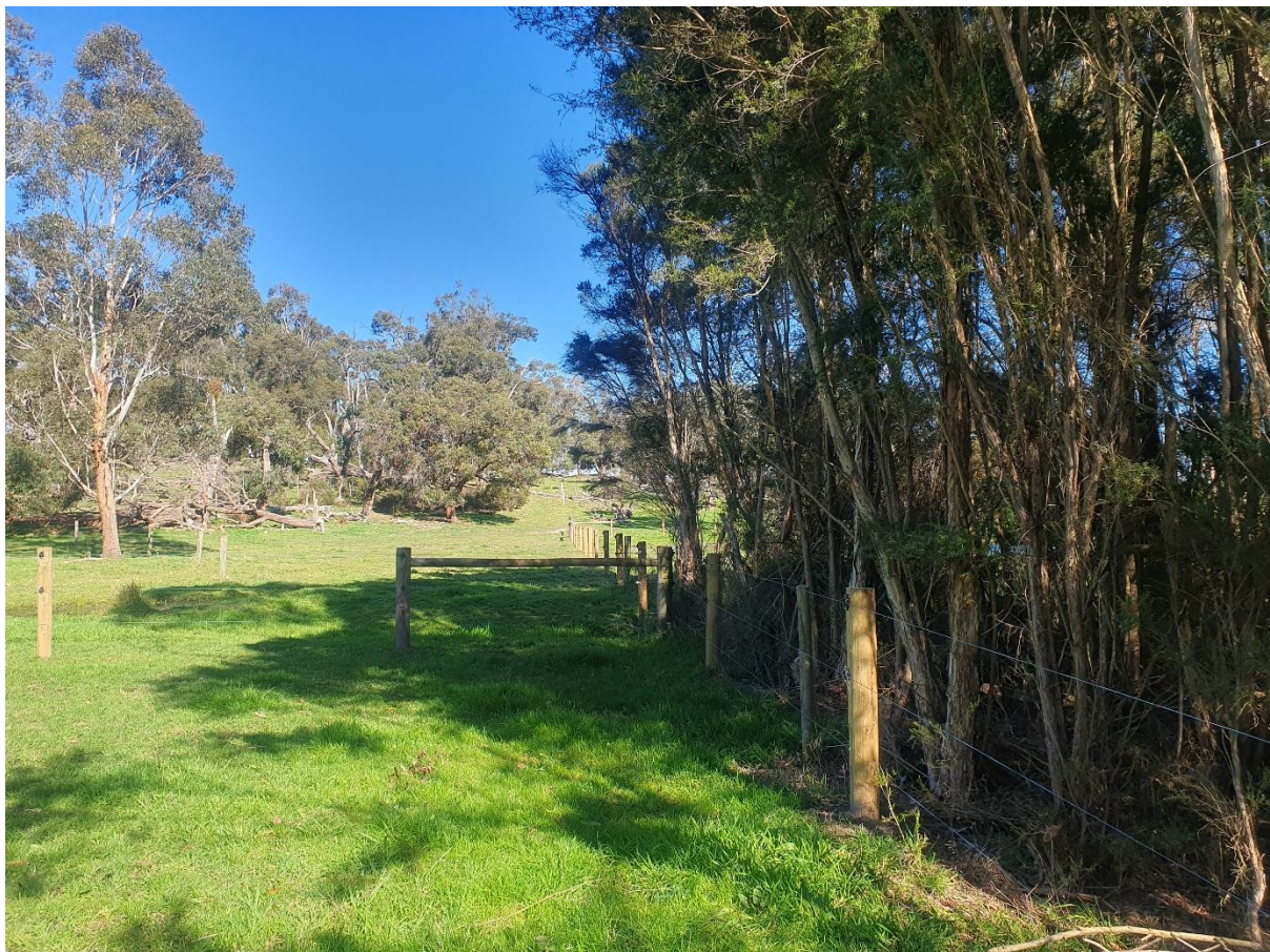
Image: Stockproof fencing at Meeniyan restoration site.

The West Gippsland team plans to deploy remote cameras more frequently at selected covenants, so that we increase our and the landholders' understanding of the wildlife the protected habitats support.