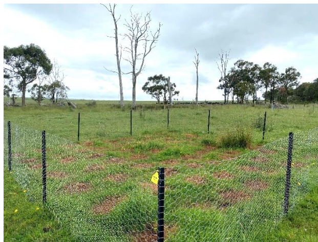
An example of a finished plot that has had site preparation completed and a Photopoint installed (see yellow cattle tag).