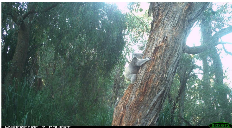
A Koala captured on remote camera on a property in Foster, that neither Trust for Nature staff nor the landholders knew to be on the site. This property is in the process of being covenanted and will soon protect habitat for this species in perpetuity.

A significant outcome of using remote cameras is that landholders gain additional knowledge about their properties, and it can often spark a deeper interest and enthusiasm in managing their land. It is hoped that in the future any significant findings of possible threatened species, will also assist landholders to receive potential grants to improve the habitat on their property.