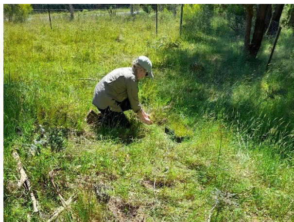
Trust for Nature staff planting at Archies Creek