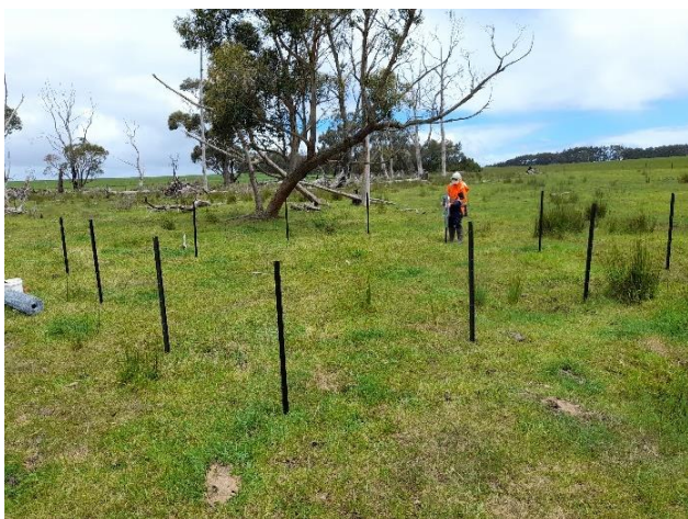
Trust for Nature staff installing an exclusion fence. Each plot was initially planted with approximately 50 plants.

The first round of revegetation works was completed in Spring 2023. Contractors prepared the site through weed control and spray circles. Ten fenced exclusion plots were installed by Senior Project Officers John Hick and Gabby Fitzgerald to minimise potential browsing pressure. Contractors planted 2,800 plants, in which different guarding methods were used to determine the most effective. The majority of plants went into the exclusion plots, whilst some went outside trialling both guarded and unguarded techniques. Gabby Fitzgerald installed monitoring Photopoints across the site and has completed the Draft Management Plan, which is currently being reviewed by the landholders.