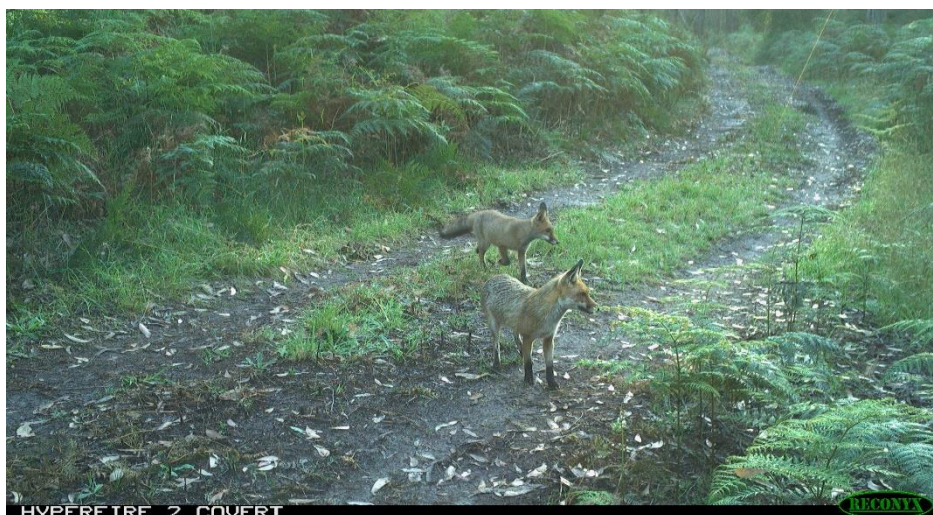
A pair of juvenile Red foxes confirmed on a covenant in Hedley.

Trust for Nature staff have been using remote cameras to obtain additional information on properties, that is unable to be gathered during usual site visits. Remote cameras have been deployed at a covenant in Hedley and a property in Foster that is in the process of being covenanted. The information acquired allows Program Managers to have a more informed understanding of the fauna species that inhabit a property, both native and invasive. This data can influence the management actions and information contained in a covenant management plan.