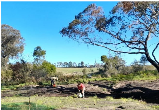
Trust for Nature staff planting alongside the landholder at Stockdale

Released funds from the WGSF enabled Trust for Nature to increase its capacity to control Sweet Pittosporum at the Archies Creek covenants and monitor improvement in habitat condition. These funds provided 8 hectares of Sweet Pittosporum control, which has been vital in significantly reducing its density and the adverse impacts it has on local flora and habitat quality. Released funds also enabled additional woody weed control at a covenant in Bena that protects Giant Gippsland Earthworms. Contractors were engaged to sensitively spray patches of Blackberry to compliment works completed through another Project.