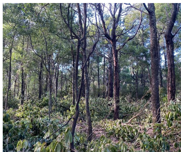
Examples of extensive areas of Sweet Pittosporum control at the Archies Creek covenants, funded through the Gippsland Conservation Fund