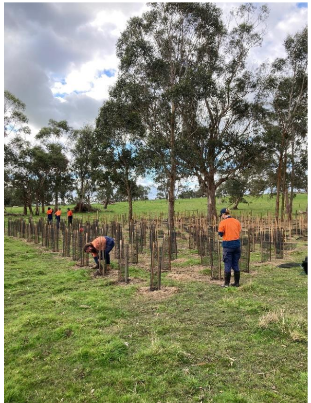
Examples of completed revegetation works undertaken by our local contractors, where individual tree guards were used. It is hoped overtime this planting will provide a buffer from the adjacent farmland and outcompete the dominant pasture grasses.