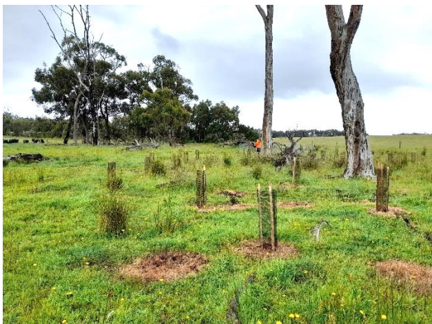
Examples of individual guards used to guard scattered eucalypts throughout the site. The spray circles are also depicted in the images.